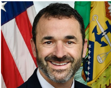
Danny Werfel, former IRS Commissioner