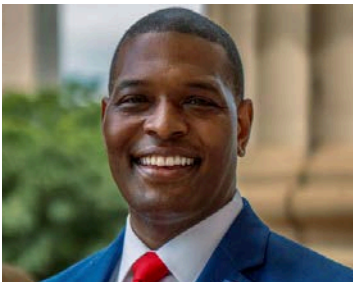
Michael Regan, former US EPA Administrator