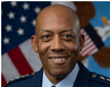
Retired General Charles Q. Brown Jr., former Chairman of the Joint Chiefs of Staff

The Sanford School is also honored to have an esteemed group of people who will be joining us at Sanford as Distinguished Fellows and Executives-in-Residence. Their presence and participation will elevate our work on research, teaching and policy engagement.